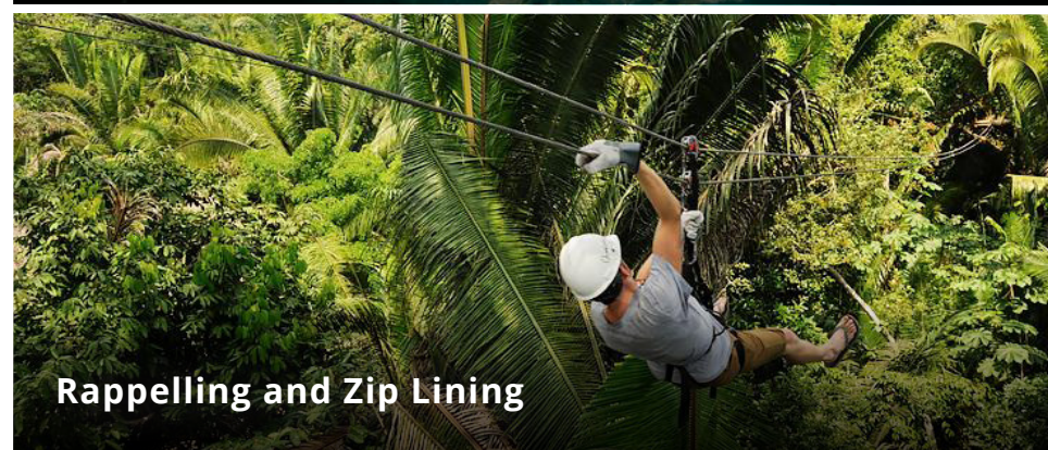
Rappelling and Zip Lining