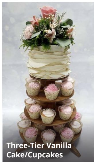
Three-Tier Vanilla Cake/Cupcakes