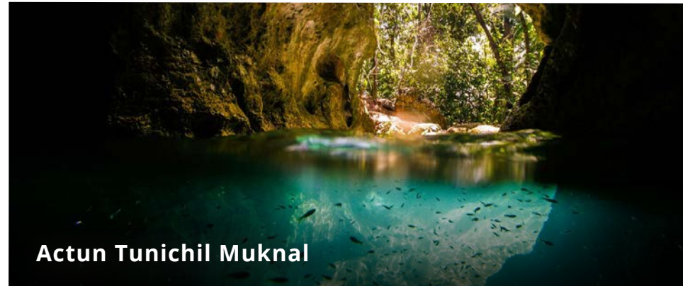
Actun Tunichil Muknal