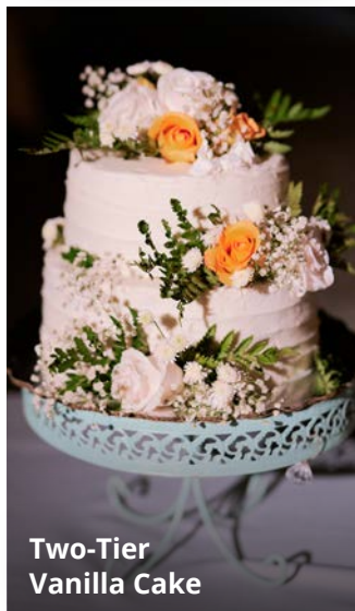
Two-Tier Vanilla Cake