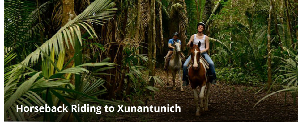
Horseback Riding to Xunantunich