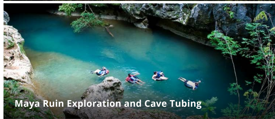
Maya Ruin Exploration and Cave Tubing